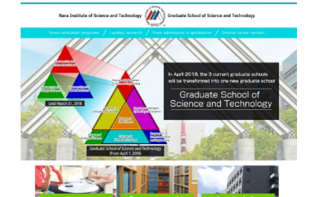
〈 New Graduate School Special Website 〉