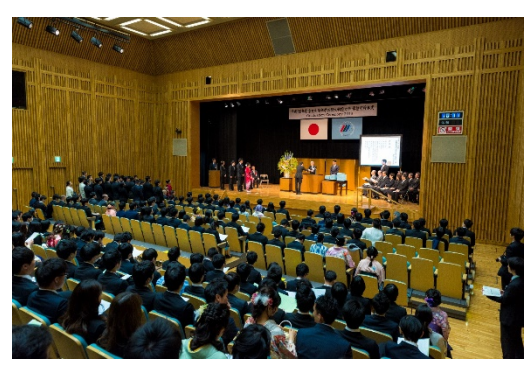
⟨ NAIST 2018 Graduation Ceremony (March) ⟩