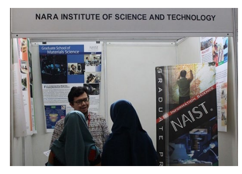
⟨ NAIST Indonesian Staff PR Activities⟩

To establish a structure for the flexible and expedient organization of interdisciplinary educational curriculum of the 3 current fields and with the current graduate school curriculum, NAIST resolved to create a 1 graduate school, 1 department structure in 2018. In it, 7 education programs foster globally active human resources with broad and highly specialized knowledge of advanced science and technology, with internationally focused faculty gathering from different fields to educate to develop the specialized skills and knowledge and the broad understanding demanded by society and for interdisciplinary research collaboration and education.