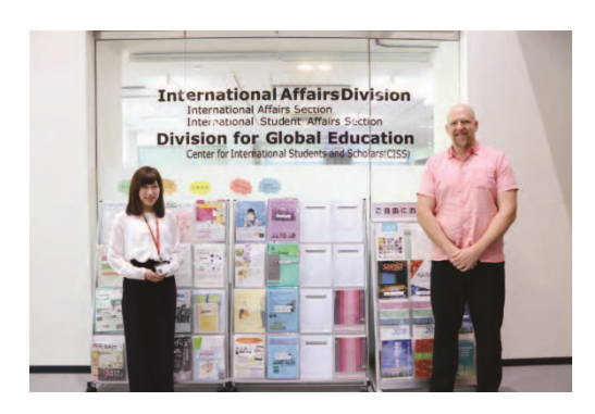
(Center for International Students and Scholars (CISS))

With Japanese corporations requiring advanced Japanese skills, an N1, N2 Japanese Proficiency Exam preparation course was held for those students wishing to work in Japan. A job fair was held on campus to assist international students in meeting with suitable Japanese corporations. Various career planning support was offered including business start-up seminars for those students who are interested in starting their own venture business.