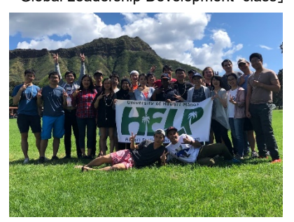
〈 Hawaii English training 〉