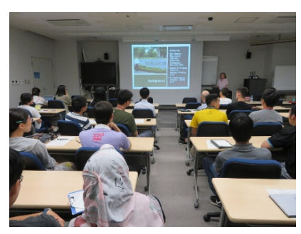
〈 Career Meeting with Alumni 〉