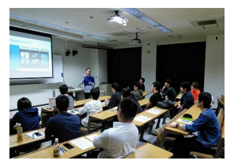
〈 Cultivating Global Career Aspirations Seminar 〉