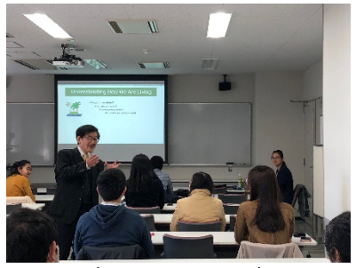
⟨ Hakunetsu class! ⟩ 「Global Leadership Development class」