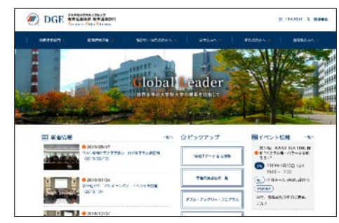
〈 Renewed DGE Website 〉

Two new DD programs were established with University of Paris-Saclay and Sorbonne University, expanding our overall partner programs. After executive review of current program results, exchange activity, etc., the Universite Paul Sabatier program was renewed and the University of Oulu program was ended. This review assures proper growth for the DD program structure and content.