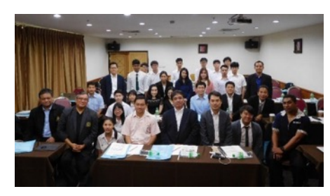
⟨ Thai Student Symposium ⟩